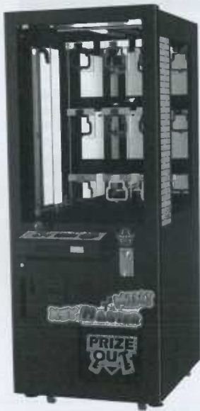
Sega Key Master Mini Black