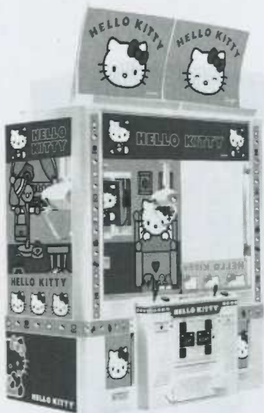
Namco UFO Catcher Comes with various branding