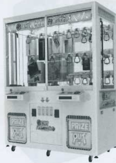
Sega Key Master Giant