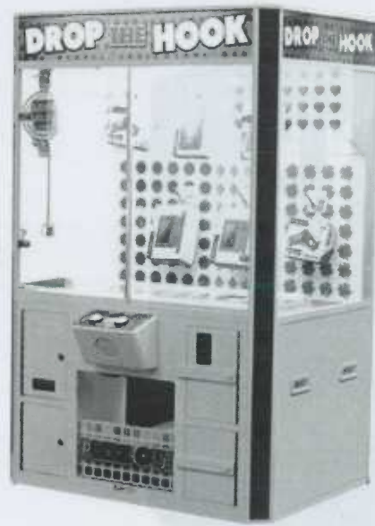
Namco Drop the Hook Could be branded Jellybean or Powerhouse