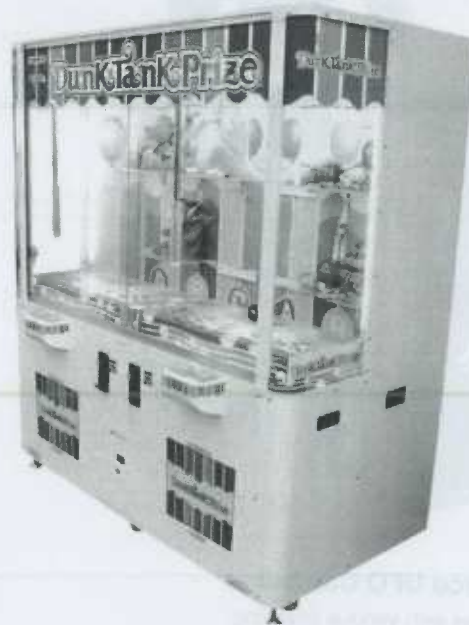
Namco Dunk Tank Prize (2 Player)