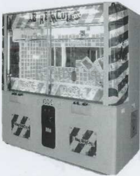
Namco Barber Cut (2 Player)