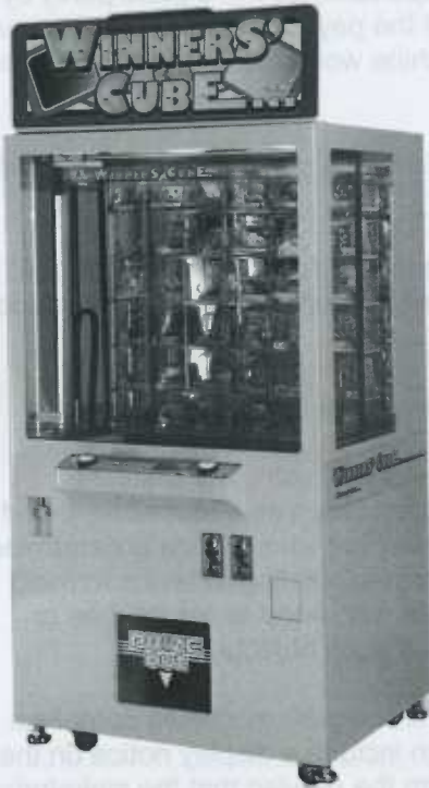
Namco Winners Cube