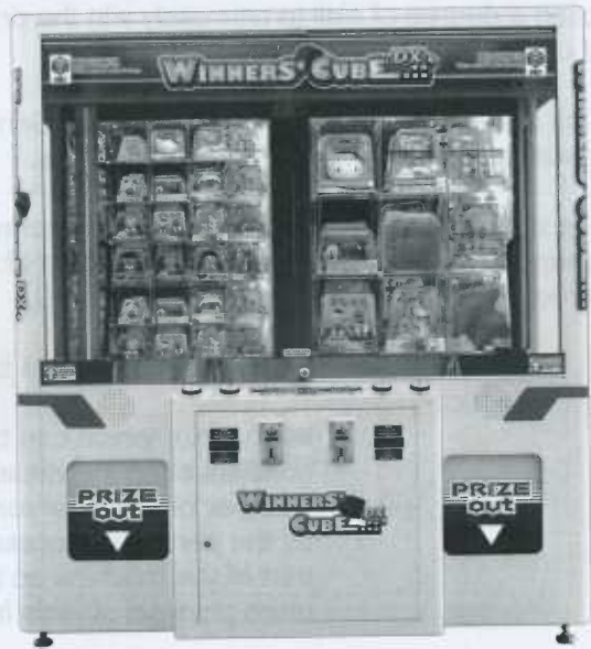
Namco Winners Cube DX