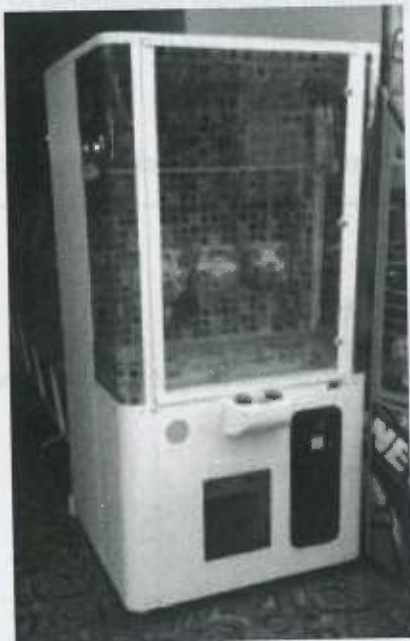
Namco Kandy Cuts

Gaming Commission Victoria Casino Hotel Victoria Square Vancouver BC V6B 4K7