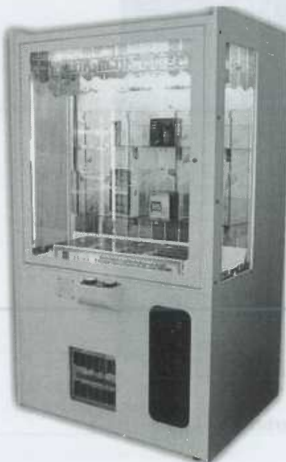
Namco Dunk Tank Prize (1 Player)