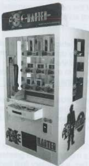
Sega Axe Master

The more popular crane-type machines which should be treated and labelled as category D gaming machines are as follows (although please note this is not an exhaustive list and we will add to it as we become aware of more machines. Also these machines may appear with different fascias or branding):