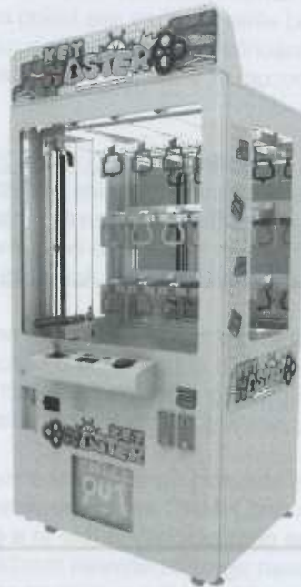
Sega Key Master